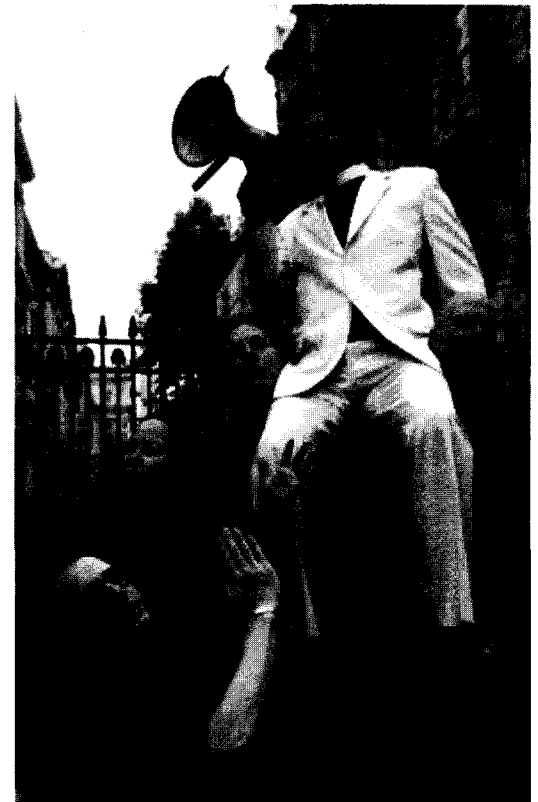
Rev. Billy and members of the Church of Life After Shopping Choir carry their message to England with their usual flair.