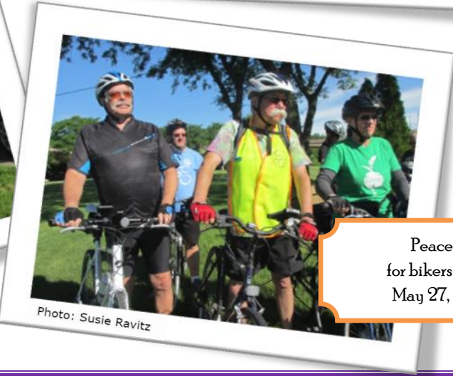
Peace-A-Thon for bikers and walkers May 27, Bethlehem