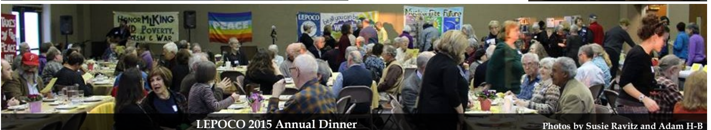
LEPOCO 2015 Annual Dinner